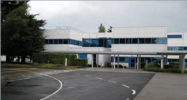
Pharmaceutical development, Merck Sharp & Dohme