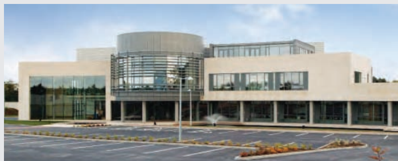
Commercial / Warehousing project, Dublin, Ireland