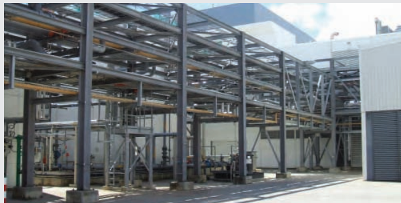
Pharmaceutical / Manufacturing project, Ireland